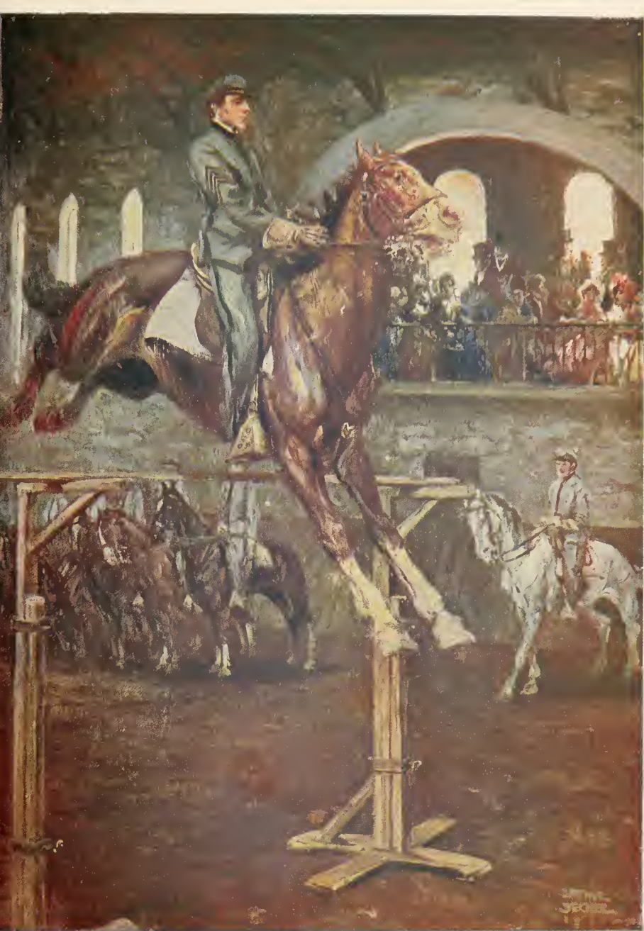
GRANT ON HIS HORSE "YORK" MAKING EXHIBITION JUMP IN THE RIDING ACADEMY AT WEST POINT.